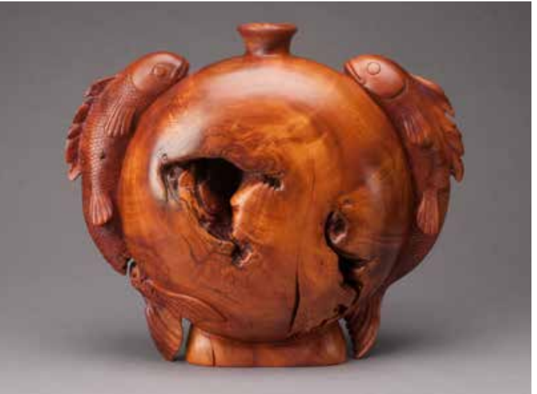
Top: Michelle Holzapfel, Self-Portrait , 1987, OBJ 1236 Bottom: Michelle Holzapfel, Fishes Vase #1 , 1987, OBJ 120