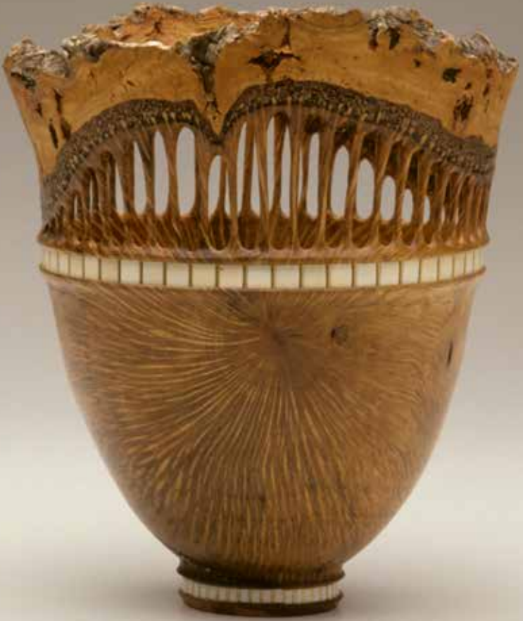
Frank Cummings III, Nature in Transition , 1989, OBJ 79