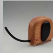
Hilary Pfeifer, USA Woody Elephant $45