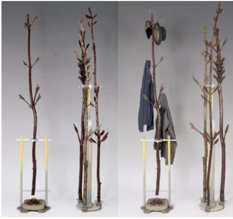
Gabriel L. Romeu, Personal Hangups, all natural , 2011-12 (Showing Autumn displayed and dressed)

To see the entire exhibition visit the exhibit page .