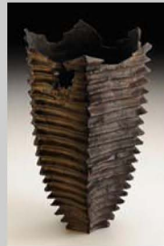
Marc Ricourt, France Elm, scorched and waxed 19" x 12" Price: $3,600