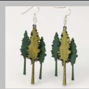
Green Jewelry San Diego, CA Earrings $15

Join us for the dedication of the new Mural on Quarry Street at N. 3rd Street - Written in Wood by Benjamin Volta. The mural is an innovative collaboration between The Center for Art in Wood and the City of Philadelphia Mural Arts Program. The mural highlights the objects on view in the museum collection at The Center, which contains over 850 objects from around the world, ranging from traditional functional every-day objects to contemporary sculpture. Black silhouettes depict sculptures and furniture found in The Center's museum collection. Stretched abstracts of the objects inspired the wood grain background. The artwork creates a landmark encouraging passersby to explore the diversity of art made from wood at the nonprofit Center. Participants in the Mural Arts Program's Guild Program assisted in the creation of the work. Written in Wood was made possible by the generous support of the Hummingbird Foundation.