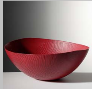
Friedemann Buehler Bowls price range from $900 - $2700

On Friday, November 11, The Center for Art in Wood officially threw open its doors with an Opening Celebration Party attended by more than 130 guests - artists, donors, members and friends -- from near and far.