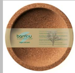
Bamboo Cork Bowls & Trays $12 - $20