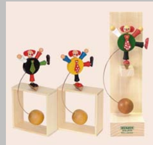
Balancing German Clowns $8 - $38