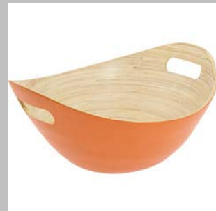
Core Bamboo Bowls $28 - $45