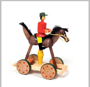
Traditional Toys from Germany $8 - $38