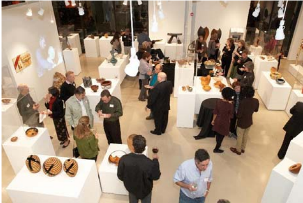
Opening Celebration guests enjoying themselves