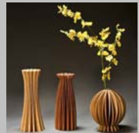
Seth Rolland Vases